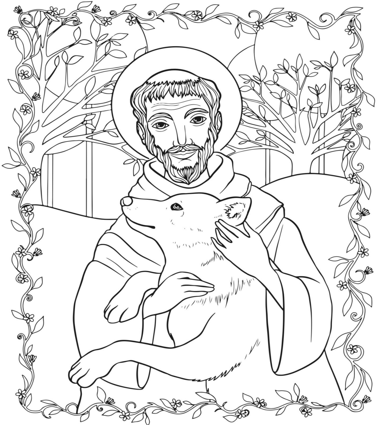
The Wolf and Saint Francis of Assisi

These coloring pages are based off the illustrations in Saintly Creatures published by Word on Fire Spark. To get the book, visit https://wordonfire.org/creatures