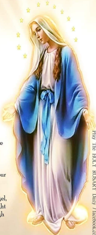
Pray The HOLY ROSARY Daily

Pour forth, we beseech You, O Lord, Your grace into our hearts: that we, to whom the Incarnation of Christ Your Son was made known by the message of an Angel, may by His Passion and Cross be brought to the glory of His Resurrection. Through the same Christ our Lord. Amen.